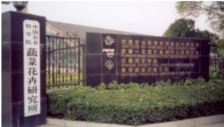
The entrance to the Institute of Vegetables and Flowers(Above).

I was placed into the Institute of Vegetables and Flowers. The Institute of Vegetables and Flowers (I.V.F.) is one of the specialized institutes governed by C.A.A.S. Its mission was produce crops that are of a superior quality, have a high yield, and are disease resistant.