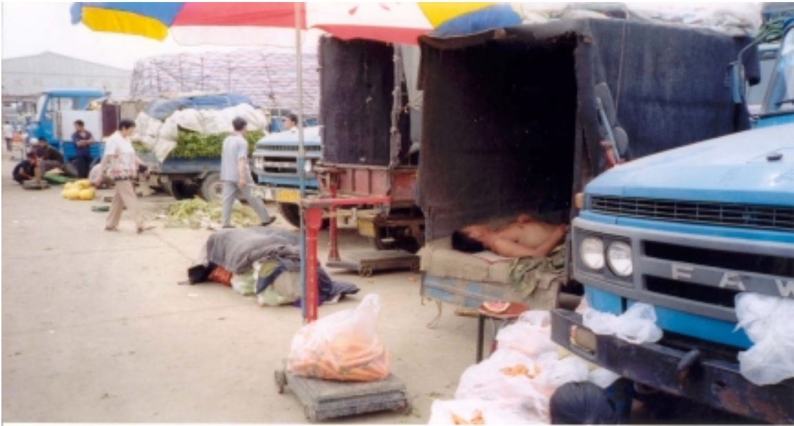
A common scene at a wholesale food market in rural China. Farmers perform every activity involving their crops from harvest, to taking them to the market. With such over-production farmers are forced to sell, and in most cases bargain, their goods at extremely cheap prices.

Other nations need to recognize China as a developing country and allow it do what works best for it in its particular situation. Even though it is a developing country, it is one of the oldest civilizations in the world, and it will take time to ease into an international economy and market.