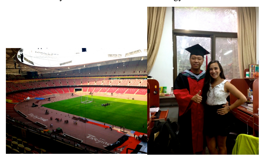
Beijing Olympic Stadium