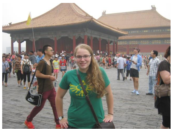
A photo of me during my visit to The Forbidden City

When I wasn't out sightseeing I was pretty excited to experience civilian life. I took advantage of the opportunities I had to explore CAAS's campus and I left the campus with a mentor every chance I got. Through some intentional and some unintentional circumstances I had the opportunity to interact with Chinese banks, post offices, malls, bakeries, restaurants, hospitals, trains, buses and taxi cabs. Each of these encounters was a fantastic opportunity to learn more about typical daily life in China as well as practice my interaction skills with people who speak different languages.