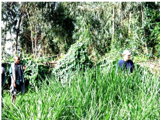
Napier Grass is tall, productive and very drought resistant.

Pennisetum purpureum , commonly known as Napier grass, is a forage that has received attention in the past few years for its use in smallholder farming systems as a cut-and-carry