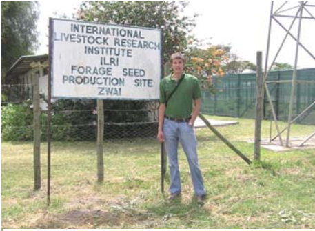
ILRI has several research centers in Ethiopia. I worked in Addis Ababa and Debre Zeit.

The International Livestock Research Institute (ILRI) is a non-profit, non-governmental organization that began its first operations in January of 1995. It developed from the