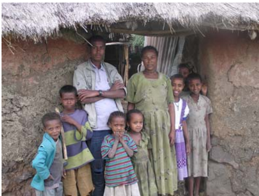
The farmer (woman in green dress) is one of the farmers I had the opportunity to interview. She has found the new clones of Napier more productive and plans to plant more next season.

I learned that the best way to learn what attributes of a crop are most important in a farming system, is to see how it functions as a part of the system itself. Primary uses, disease or management problems and environmental issues are all considered when