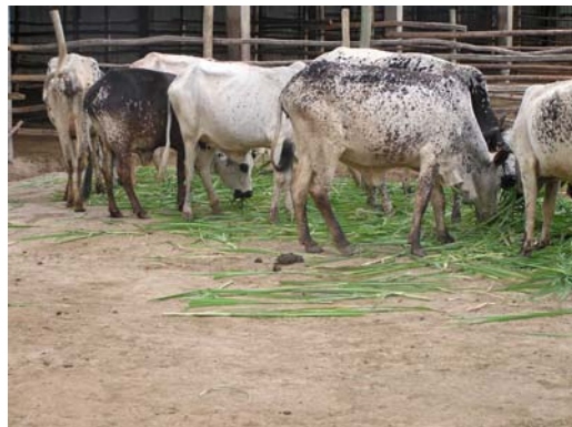
Cattle of local farmers fed with new accessions of Napier grass show good growth and milking ability. Over half of the farmers I surveyed grew Napier to support their cattle.

Napier grass is known and has been recognized as a cut-and-carry livestock feed. Continuous grazing does not allow the plant time to regenerate, and it often begins to die as it is not permitted to produce foliage. A majority of the farmers also expressed that they would be moving their Napier to better soil away from the fence row, where it would not have to compete with the fence row bushes. Since Napier grass needs good water and nutrients from the soil to produce at its highest potential, farmers saw problems when it is planted around other crops and was required to compete for resources.