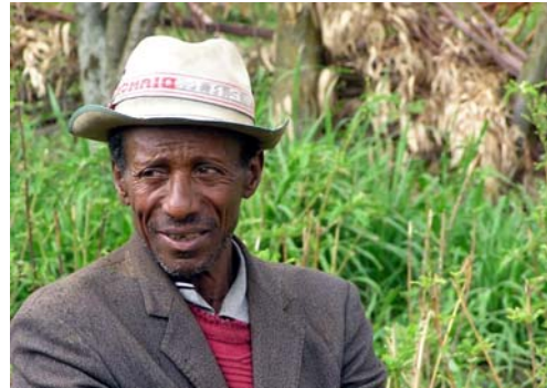
Four days were scheduled during the first full week of July for a small survey to interview farmers from the Babogaya and Genda Gorba villages.