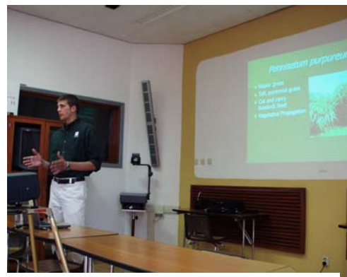
My concluding seminar to the staff at ILRI.