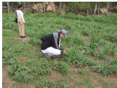
New plantings of improved accessions of Napier provide an option for farmers challenged to find better ways to feed their livestock.