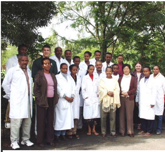
Researchers, staff (and me) at ILRI, Addis Ababa, Ethiopia.