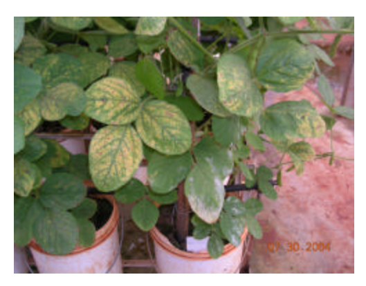
Symptoms of soybean rust