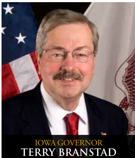
IOWA GOVERNOR TERRY BRANSTAD