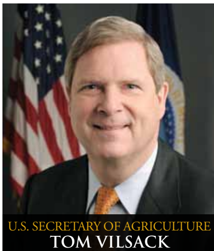
U.S. SECRETARY OF AGRICULTURE TOM VILSACK

This year, we honor Iowa Governor Terry Branstad and U.S. Secretary of Agriculture Tom Vilsack for their extraordinary leadership in promoting agriculture and agribusiness, particularly in regard to the visit of Chinese Vice President Xi Jinping, and for supporting exceptional educational opportunities for the next generation.