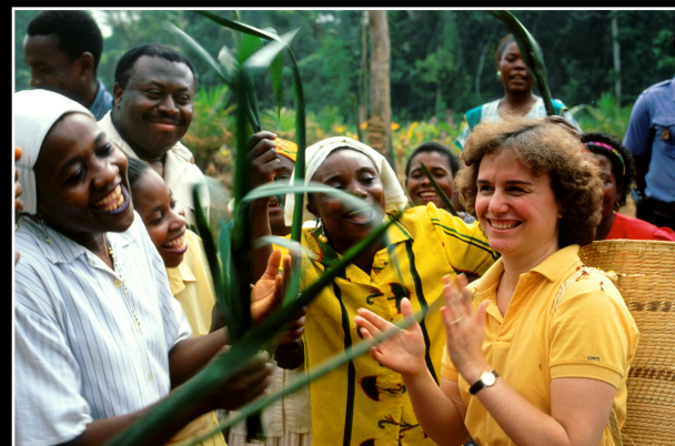
2003 World Food Prize Laureate Hon. Catherine Bertini, United Nations

“The World Food Prize ... the international recognition that is known as ‘The Nobel Prize for Food and Agriculture.’”