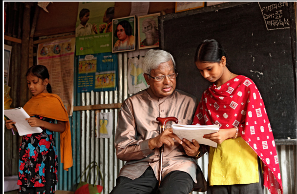
2015 World Food Prize Laureate Sir Fazle Hasan Abed, Bangladesh

T he $250,000 World Food Prize recognizes individual, specific, tangible achievements in any field involved in enhancing food production and distribution and increasing food availability and accessibility to those most in need, thereby reducing human suffering and improving health and nutrition.