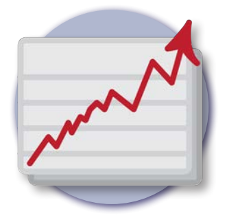
PROMOTING ECONOMIC GROWTH