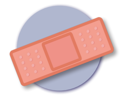
IMPROVING HUMAN HEALTH

IT'S COMPLICATED, BUT WE'RE MAKING PROGRESS. WE CAN END HUNGER AND POVERTY BY FOCUSING ON: