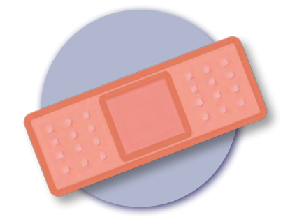
IMPROVING HUMAN HEALTH

IT'S COMPLICATED, BUT WE'RE MAKING PROGRESS. WE CAN END HUNGER AND POVERTY BY FOCUSING ON: