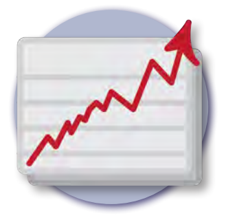
PROMOTING ECONOMIC GROWTH