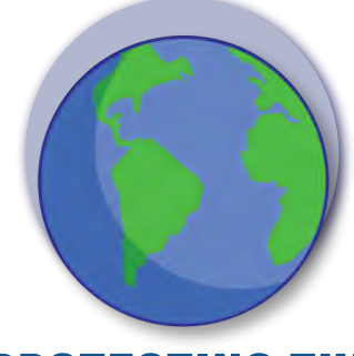
PROTECTING THE ENVIRONMENT

There have already been significant improvements but we still have a long way to go. There is no shortage of solutions. Explore what's working and what isn't, and use your unique perspective, talents and ideas to help solve the worlds greatest challenge.