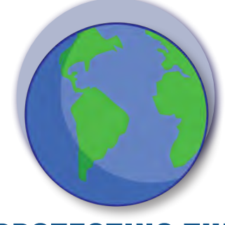
PROTECTING THE ENVIRONMENT

There have already been significant improvements but we still have a long way to go. There is no shortage of solutions. Explore what's working and what isn't, and use your unique perspective, talents and ideas to help solve the world's greatest challenge.