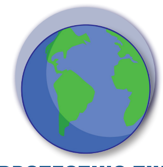
PROTECTING THE ENVIRONMENT

There have already been significant improvements but we still have a long way to go. There is no shortage of solutions. Explore what's working and what isn't, and use your unique perspective, talents and ideas to help solve the worlds greatest challenge.