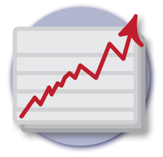
PROMOTING ECONOMIC GROWTH