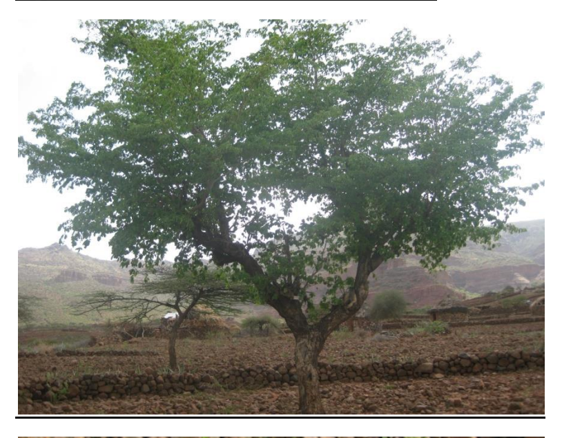
Appendix 1.2: Milk Survey Pictures, Weba Tree