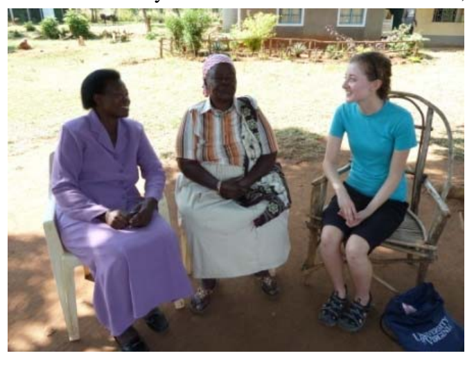
Figure 5. Visiting Mama Sarah Obama

Fellow farmers and farmer teachers could also be a way to empower females in rural Kenya. Out of all farmers interviewed, the female non-adopters lacked education