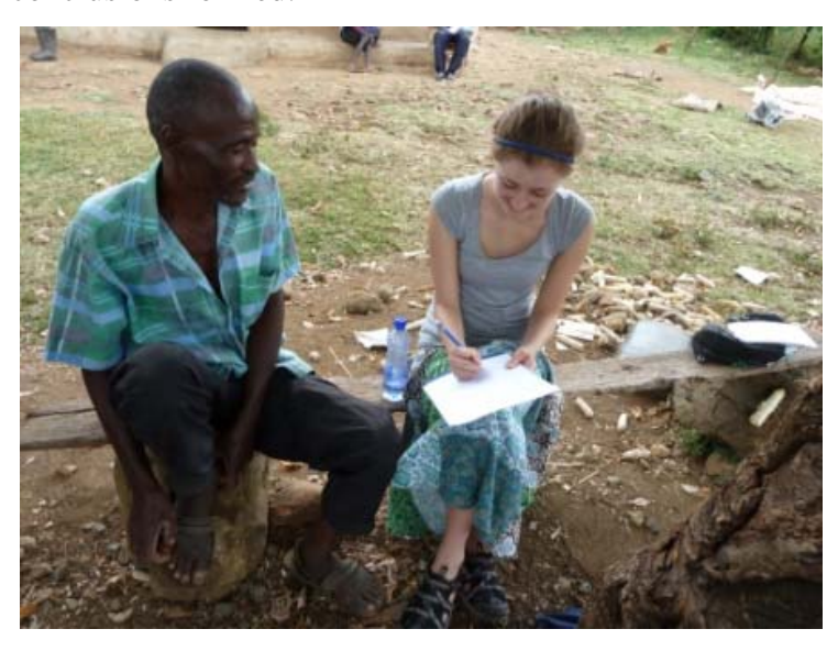
Figure 4. Interviewing a project farmer in Lambwe Division

After all 40 questionnaires were administered, I entered the farmers' responses into SPSS, a data analysis program. From that data trends were observed, analysis conducted, and conclusions formed.