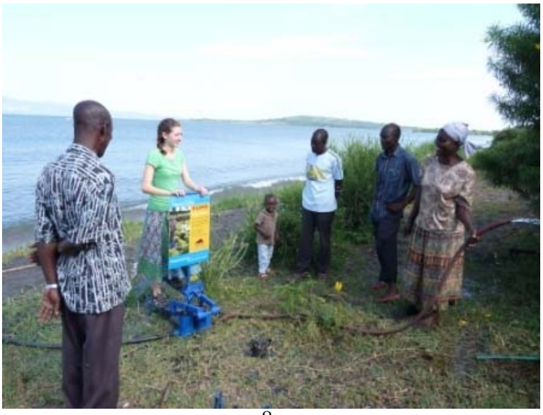
Figure 3. Testing a pedal pump on Rusinga Island

In Kenya, pedal pumps are sold by the American company KickStart. Their pumps, which are called Super MoneyMaker Pumps (Figure 3), have been adapted for use in Africa from those in Southeast Asia. The main difference is that they are portable and relatively light-weight compared to IDE's permanent pumps. KickStart also manufactures a hip-pump, which is operated with one's arms instead of legs and uses only one piston.