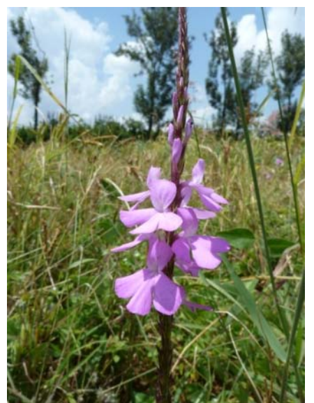
Figure 1. Striga hermonithica

Stemborers in Nyanza province, known in the local Luo as "Kundi," belong to either the native Busseola fusca or the Asian species Chilo partellus . Unseen by farmers, the females lay their eggs at night on the young maize plants. Then, true to their name, the larvae enter the stem and begin to burrow after feeding on the leaves. It is at the larvae stage that the insect causes the most damage, leaving maize stems weakened, stunting growth, and chewing holes in the stems and leaves. After growing fully, the larva pupates within the maize stem, emerges as a moth, mates, and lays eggs, repeating its cycle of destruction. Stemborers cause average maize losses of 20 to 40 %, but can