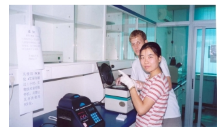
Using the microcentrifuge in DNA lab work with the cucumber group (Above).

In each group, except the eco-organic soiless culture, I would help the researchers perform tests, such as DNA isolation and purification. I also helped record data about the different plants, and allowed them to practice their English.