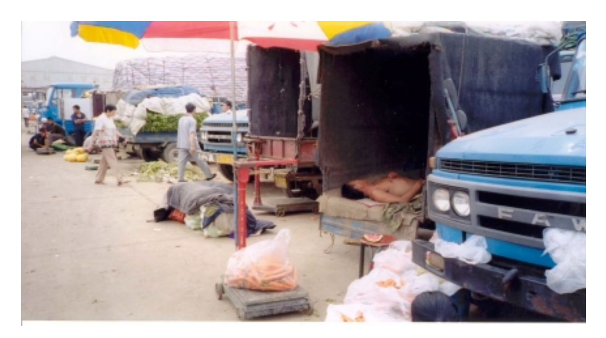
A common scene at a wholesale food market in rural China. Farmers perform every activity involving their crops from harvest, to taking them to the market. With such over-production farmers are forced to sell, and in most cases bargain, their goods at extremely cheap prices.

Other nations need to recognize China as a developing country and allow it do what works best for it in its particular situation. Even though it is a developing country, it is one of the oldest civilizations in the world, and it will take time to ease into an international economy and market.