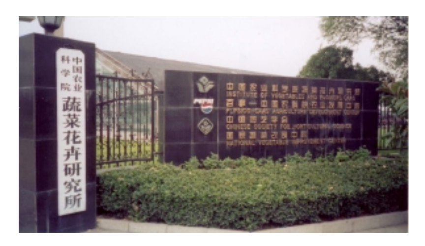
The entrance to the Institute of Vegetables and Flowers(Above).

I was placed into the Institute of Vegetables and Flowers. The Institute of Vegetables and Flowers (I.V.F.) is one of the specialized institutes governed by C.A.A.S. Its mission was produce crops that are of a superior quality, have a high yield, and are disease resistant.