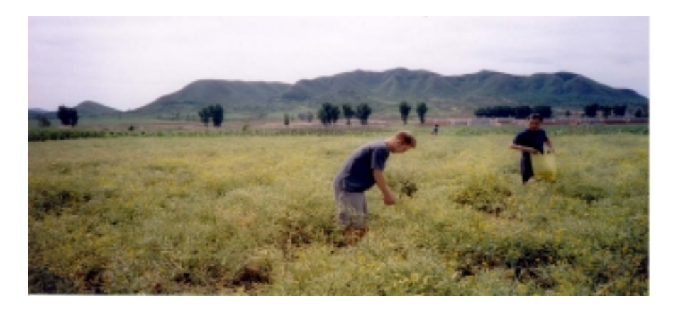
Working in a Chinese Cabbage field in the Hebei Province outside of Beijing to collect samples, data, and results (Above).

With my new knowledge, I began to understand that producing the highest quality, yield, and disease resistant crop was very important to the Chinese farmer because this was how they made their living and it enabled them to compete with an ever-growing international competition.