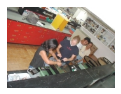
Finding Root Density