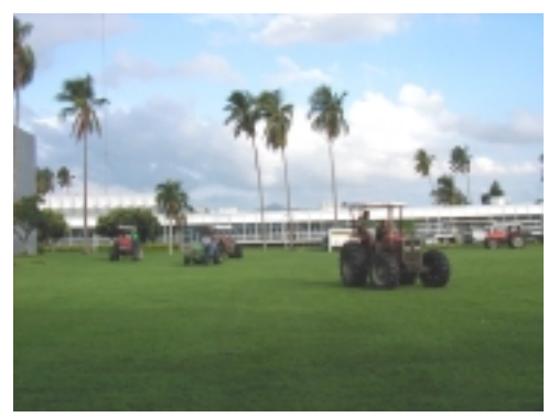
Learning how to drive tractors on the soccer field