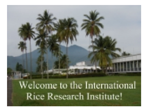
My home for the summer