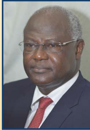
H.E. ERNEST BAI KOROMA President Republic of Sierra Leone