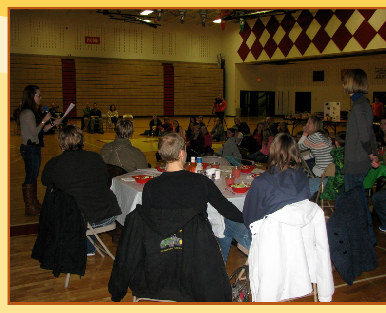
Participants at a student-led community Hunger Banquet in Boone

In Boone, a high school senior worked with Iowa-based Outreach, Inc., the school's talented and gifted coordinator, and eighthgrade students to organize a community hunger banquet raising awareness and funds