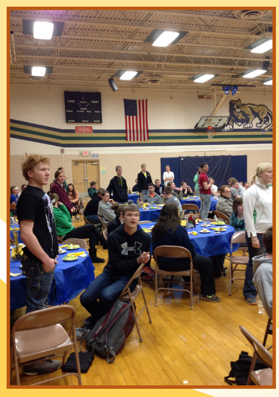
Students share a meal at a school-wide Hunger Banquet in Sumner-Fredericksburg

Recommendations for encouraging high school students' interest in hunger and supporting them as they take action include: