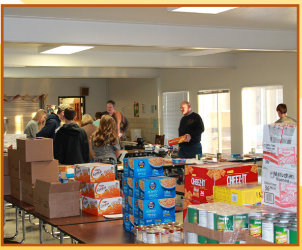
Organizers sort donations the at Clay-Central-Everly Hunger Summit

• Designing collaborations so that they further the top priorities of each partner. A successful collaboration makes the academic work of students more relevant, raises the profile of local nonprofits, and demonstrates local businesses' commitments to corporate citizenship. Clay-Central/Everly students were sensitive to the priorities of businesses and nonprofits by involving ISU Extension and Outreach, the Clay County Cattlemen, the local food pantry, and the CC/E FFA chapter as workshop leaders, and by partnering with Elanco's existing #Feedthe9 initiative.