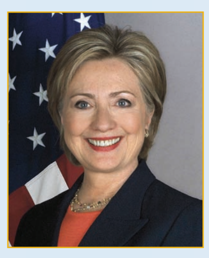
HON. HILLARY CLINTON U.S. Secretary of State