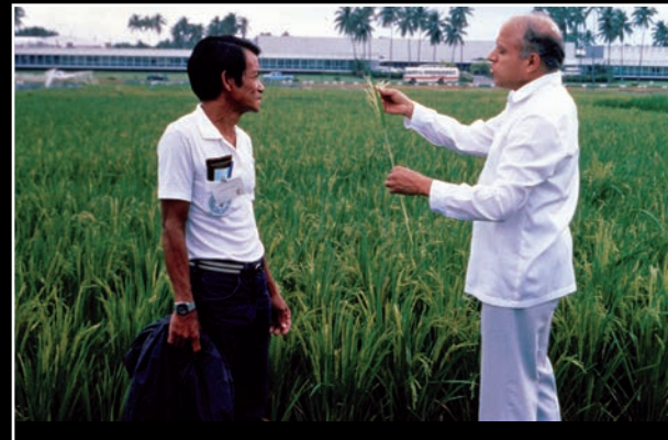
1987 World Food Prize Laureate Dr. M.S. Swaminathan, India