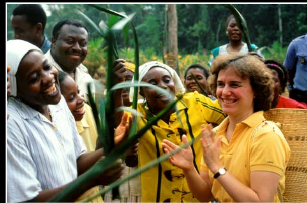
2003 World Food Prize Laureate Hon. Catherine Bertini, United Nations