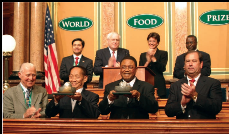
Professor Yuan Longping, China, and Dr. Monty Jones, Sierra Leone, receive the World Food Prize in 2004.