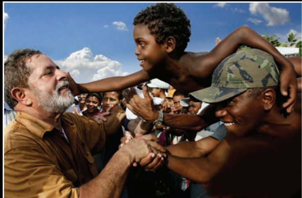
2011 World Food Prize Laureate H.E. Luiz Inácio Lula da Silva, Brazil

- H.E. Ernesto Zedillo Former President of Mexico