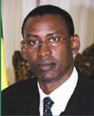
H.E. Abdoulaye Diop