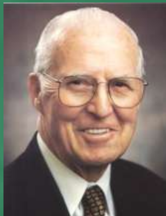
Dr. Norman Borlaug