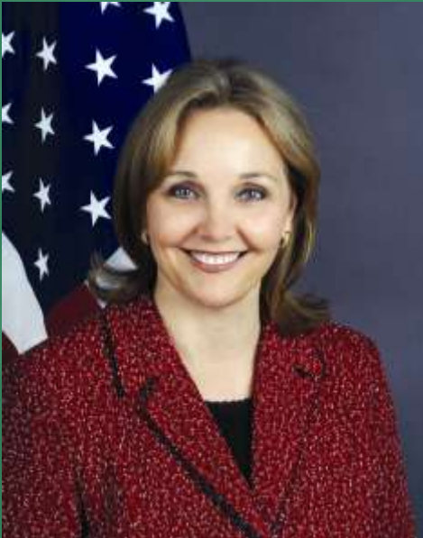
Hon. Josette Sheeran

U.S. Under Secretary of State for Business, Economic, and Agricultural Affairs