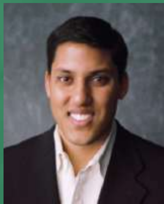
Dr. Rajiv Shah